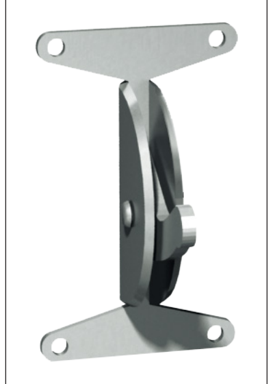
Scan for Information