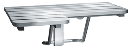
8208 FOLD-UP L-SHAPED SHOWER SEAT

ADA-Compliant L-shaped Phenolic Four-Leg Fold-up Shower Seat is fabricated of type 304 stainless steel. All exposed surfaces shall have satin finish. Seat is solid phenolic with white top and bottom surfaces and has black edges. Legs fold up when in retracted position to provide low profile against wall. Rubber cushioned stainless steel leveling feet lock-adjust throughout installation height range and compensate for uneven floors. Unit satisfies ADA Accessibility Guidelines when mounted properly.