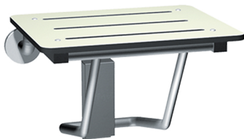
8203 COMPACT PHENOLIC FOLD-UP SHOWER SEAT